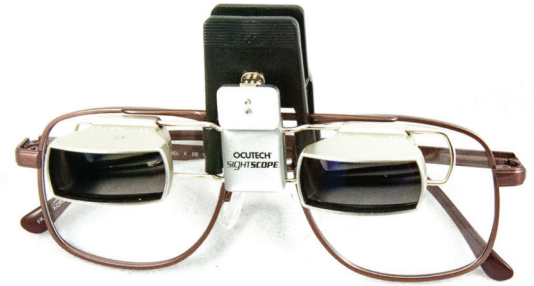
SightScope® Demonstrator Clip