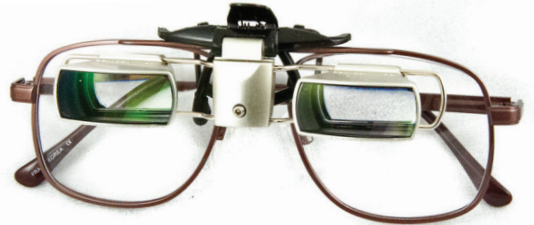
SightScope® Patient Clip