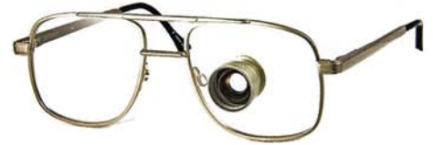
Ocutech InstaMount 0.5 Field Expander in Full Diameter Position