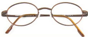
Oval: Takumi T9620 47/19/140 Brown, Gunmetal, Light Bronze