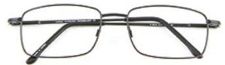
Large Rectangle: Cargo C5018 54/18/140 Brown, Gunmetal, Black