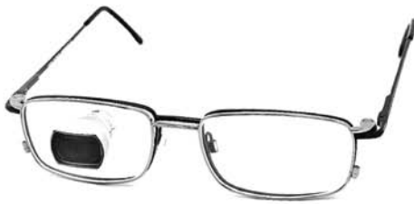
Ocutech InstaMount 2.2x Telescope in Bioptic Position