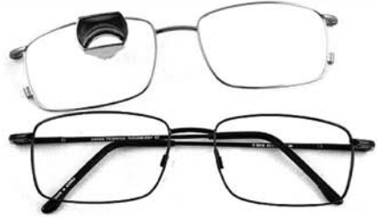
Ocutech InstaMount 2.2x Telescope taken off Carrier Frame