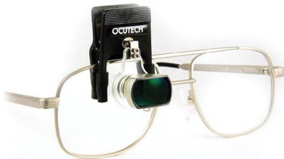
Ocutech InstaMount 2.2x Mounted on Demonstrator Clip